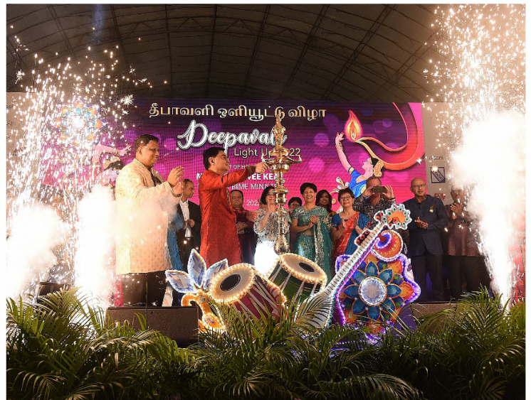
DPM Heng Swee Keat (in red) said that this year's Deepavali is a chance to reflect on the end of muted celebrations of the last two years.