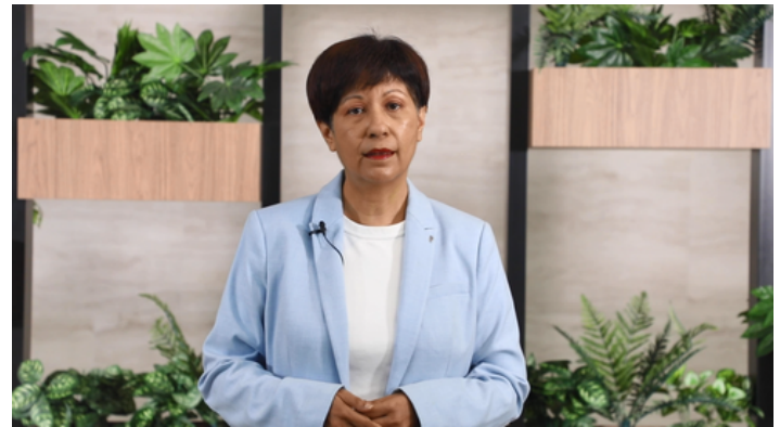
Ms Indranee Rajah's video message for the AGM

And while the economy was picking up, there were new and different challenges ahead. Among them, the ongoing geopolitical tensions and inflationary pressures, especially in energy, food, and commodities.