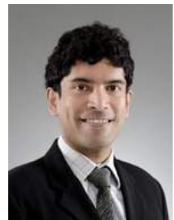
Mr Vikram Nair MP, Sembawang GRC